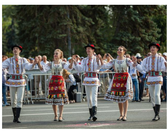
GCI – Moldova Investment Unit